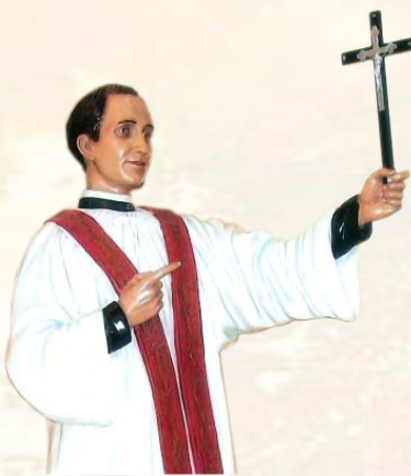
St Joseph Vaz Patron of the Association of Crusaders for Jesus with Mary

To live out its mission, the ACJM makes the Eucharist the center of its life and work as it strives to evangelize to the ends of the world and also to re-evangelize Catholics everywhere to return to meaningful Sacramental life in the Church. The Blessed Virgin Mary, Queen of the Apostles, is the Patroness of the Association.