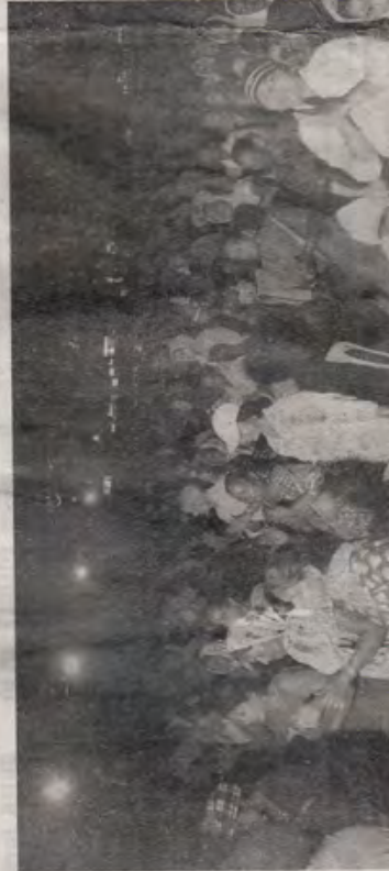
A section of the massive crowd seen in attendance at the ongoing Street Evangelisation Convention held at the Govt. Multipurpose Ground, Borda-Margao.

The large audience at the convention which was held in the form of a road side public retreat at the Multi purpose grounds at Borda heard with rapt attention the speakers explain that perhaps the best way to have this seemingly impossible attitude is for each of us to consider our own sins. Any person knows far more about their own hearts than about the hearts of others. Recognising the sinfulness of one's own heart should exclude any boastful self exaltation, they said.