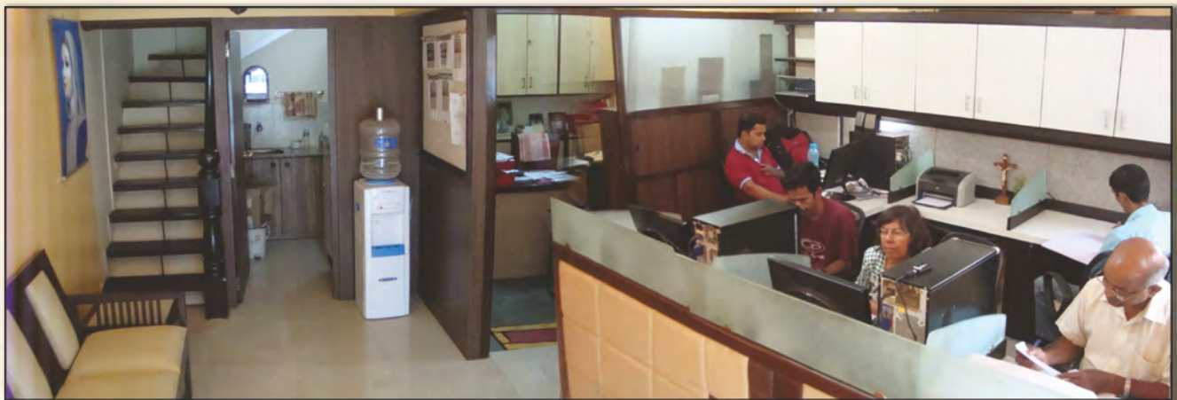
Inside view of the ACJM Head Office at Vasco, Goa with staff