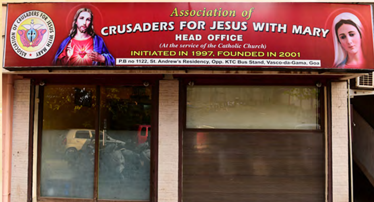
A view of the outside of the ACJM Head Office in Goa