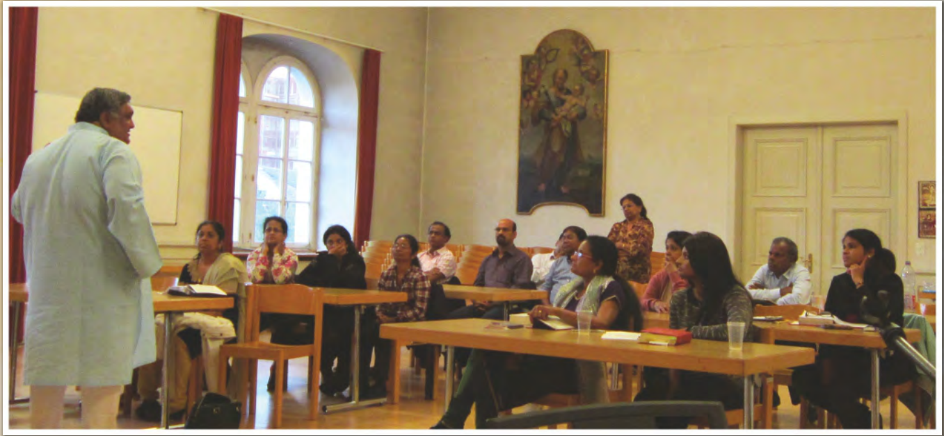
DURING AN ORIENTATION SESSION FOR LAY CATHOLIC LEADERS