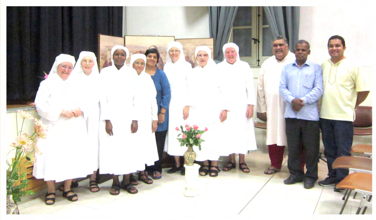
AFTER A 3-EVENING CONFERENCE WITH THE LITTLE SISTERS OF THE POOR AT ST PAUL'S HOME, MALTA