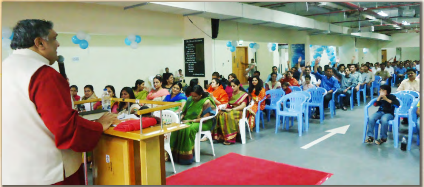
RETREAT IN JEBEL ALI CHURCH