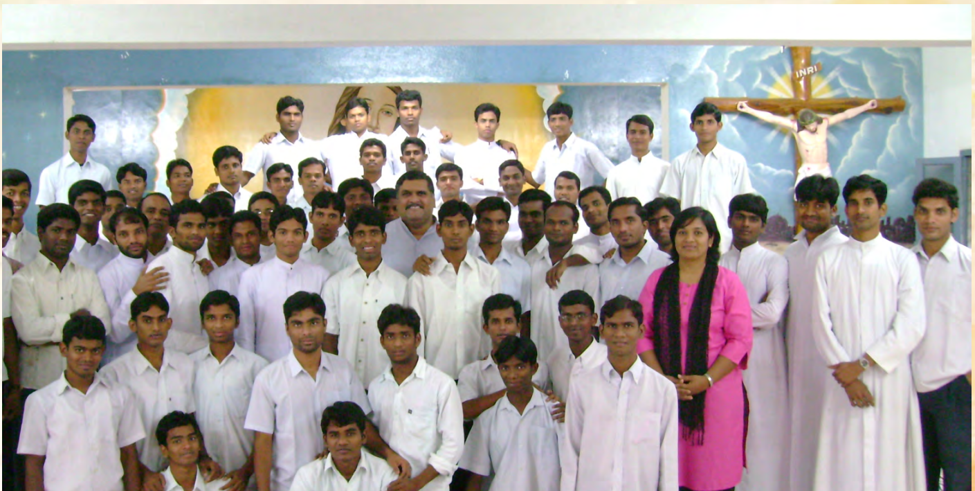
RETREAT FOR PHILOSOPHERS AND THEOLOGIANS OF THE MCBS CONGREGATION, VIJAYAWADA - ANDHRA PRADESH, INDIA