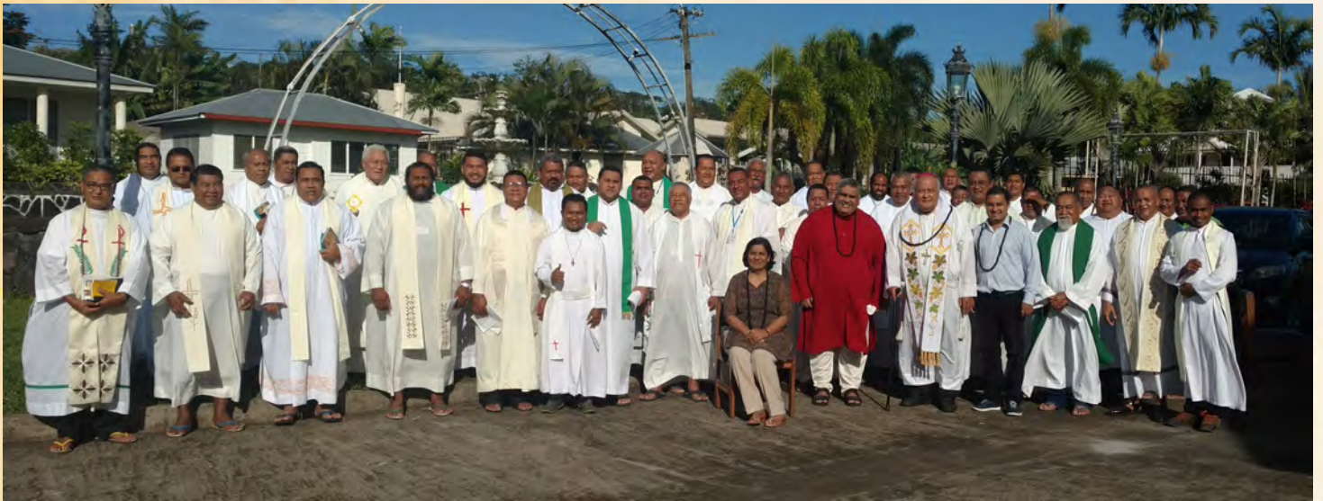
THE PRIESTS SEEN WITH THE ARCHBISHOP AND TEAM TOWARDS THE CLOSE OF THE CONFERENCES HELD IN PREPARATION OF WACOM 2020