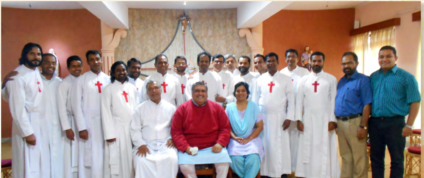
AFTER ANOTHER RETREAT FOR PRIESTS OF THE CAMILLIAN CONGREGATION