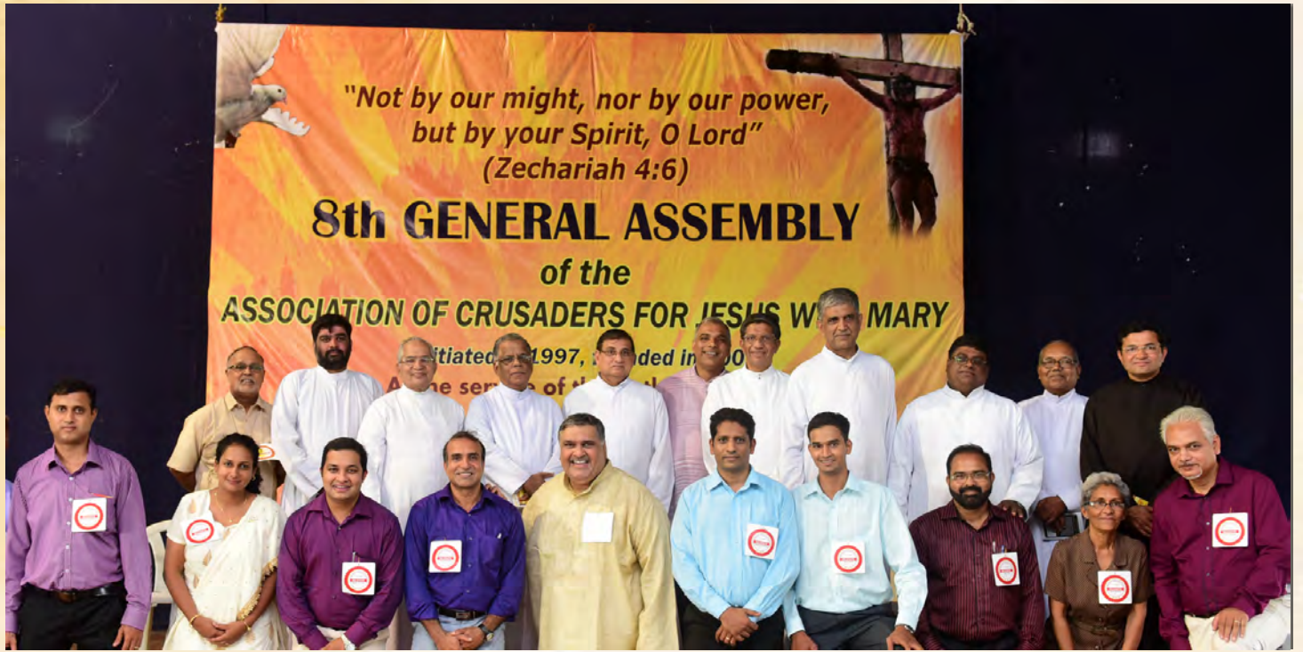
AFTER THE 8th CHAPTER OF THE GENERAL ASSEMBLY 2015, THE NEW ELECTED COORDINATOR GENERAL AND COUNCIL OF ELDERS ALONG WITH THE HIGHEST OFFICIALS OF THE CHURCH, GOA-INDIA