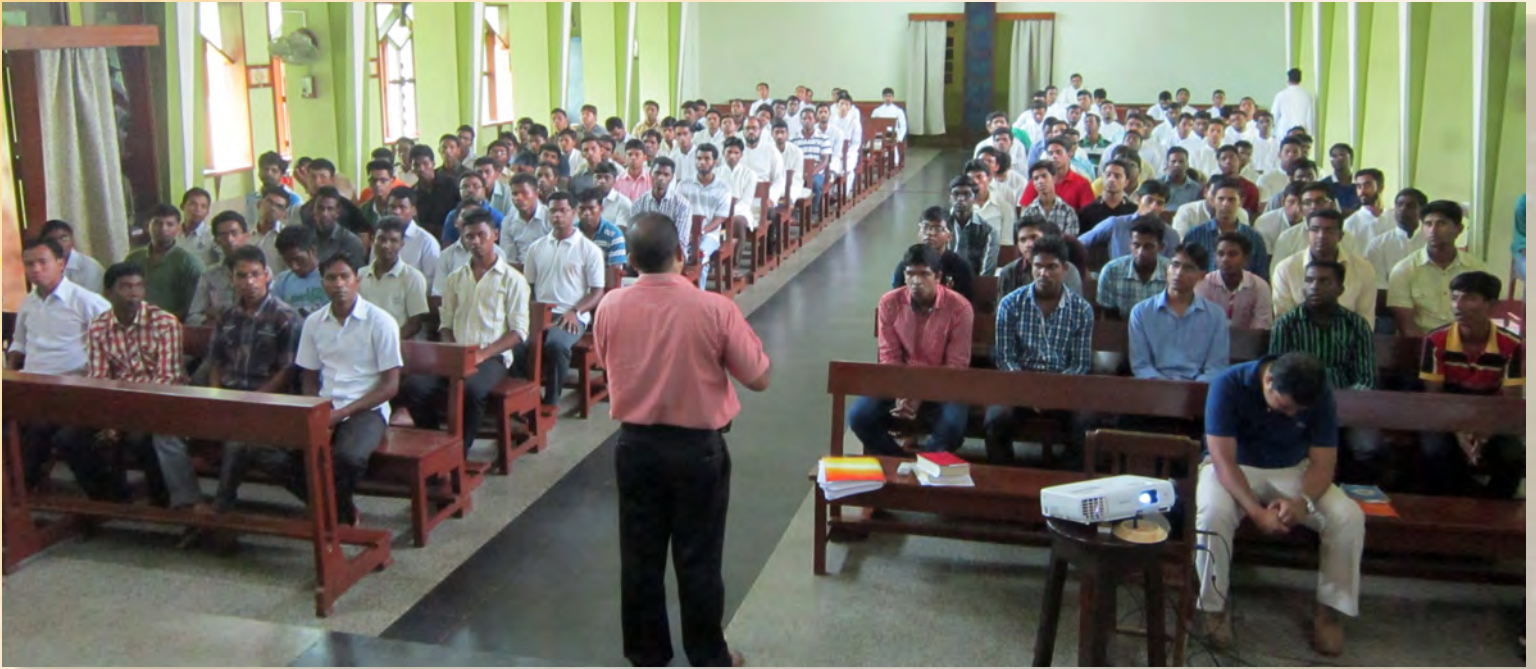
A RETREAT FOR SEMINARIANS AT THE MAJOR SEMINARY IN NAGPUR, INDIA