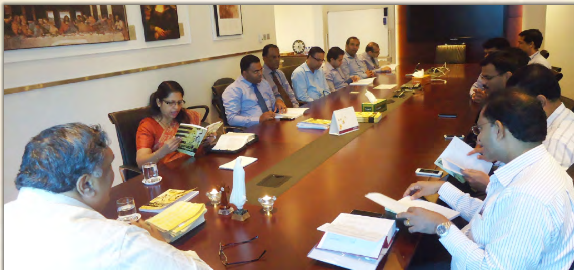
WITH CORPORATE COMPANY MEMBERS, DUBAI