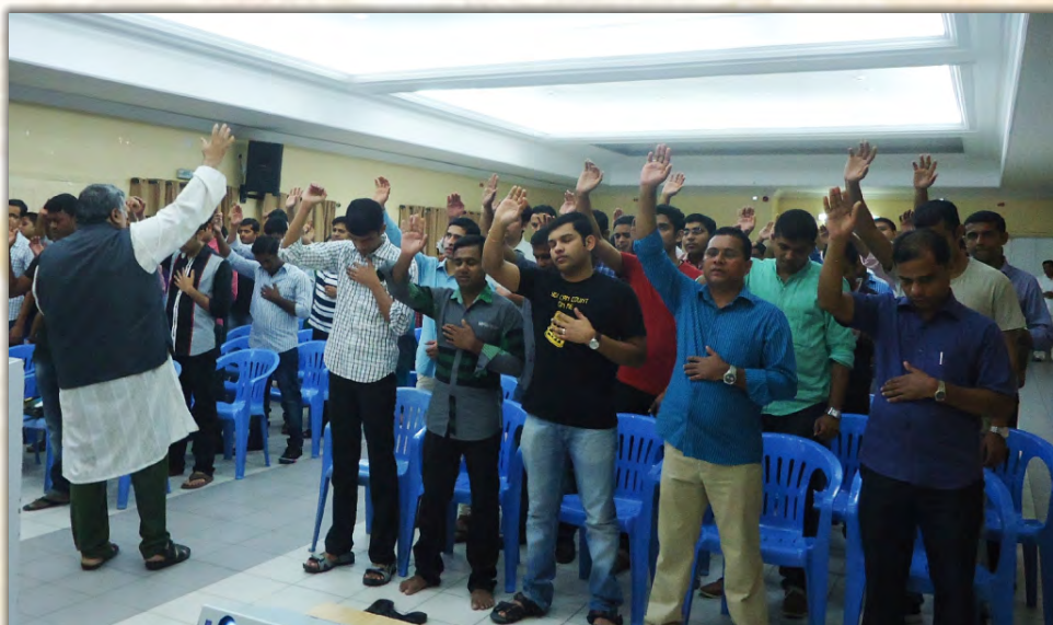
RETREAT IN DUBAI