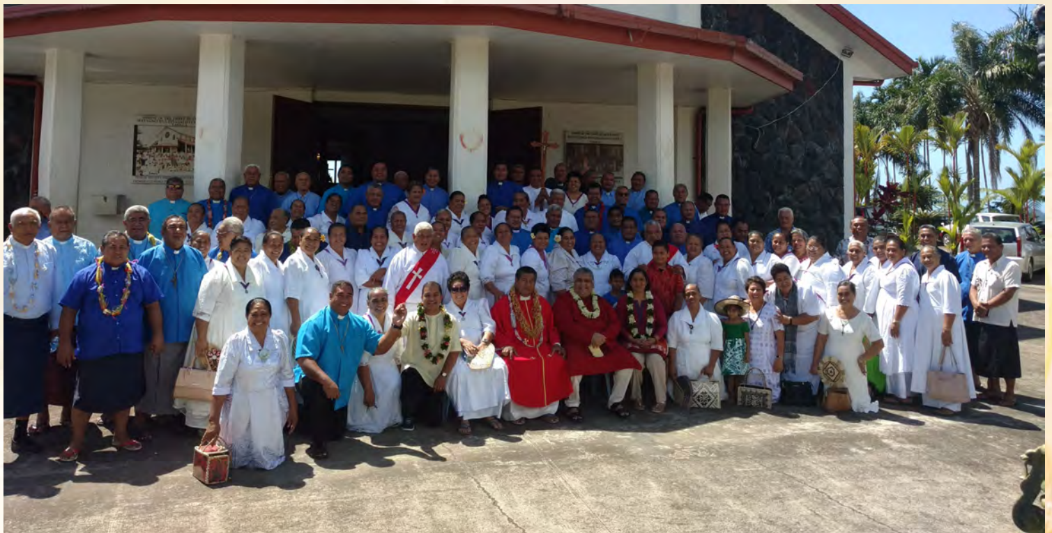
THE DEACONS DURING THEIR RETREAT HELD IN PREPARATION OF WACOM 2020